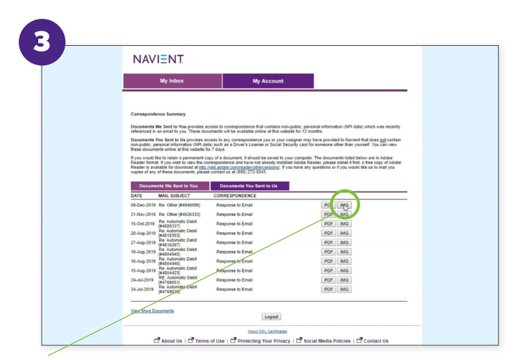
This will open a list of documents we have sent to you. Click the links to view them as either PDFs or images .